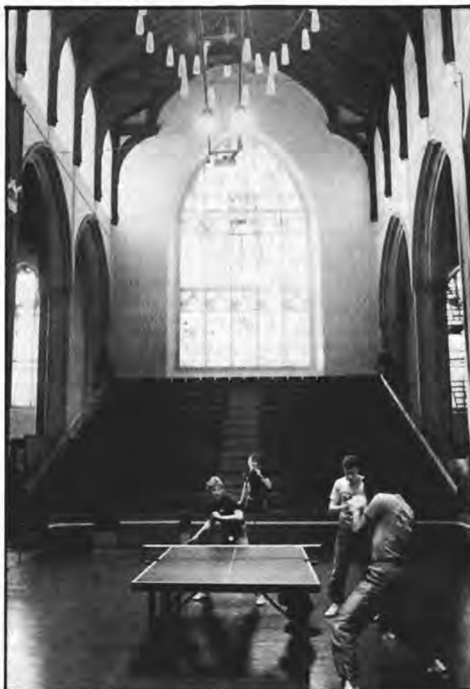
England players in practice before the International against France at the beautiful St. Andrews Hall venue with stained glass window in background

England, clearly now deep in relegation trouble, must it seems win one of their three remaining matches, away to Yugoslavia at home to Czechoslovakia and West Germany, to avoid the roof dropping in.